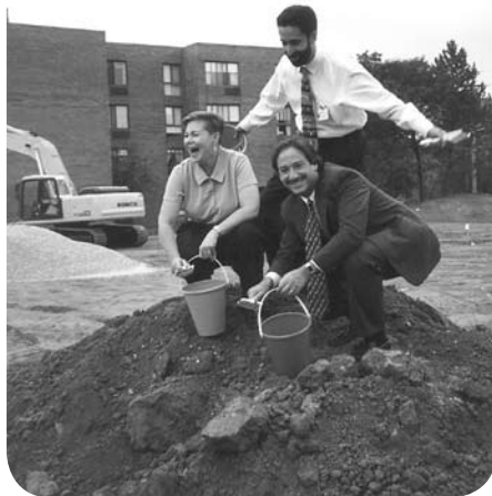
More than 10 years ago, "digging into a dream" that brought us the Center